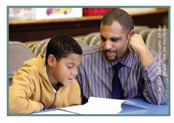
A $500,000 grant from Toyota launches the Ed Fund's Teacher Residency Program

The urban teacher resident works along side an experienced mentor teacher for one full year, and as a result, residents later enter their own classrooms with the experience and competencies that come from intense, sustained classroom