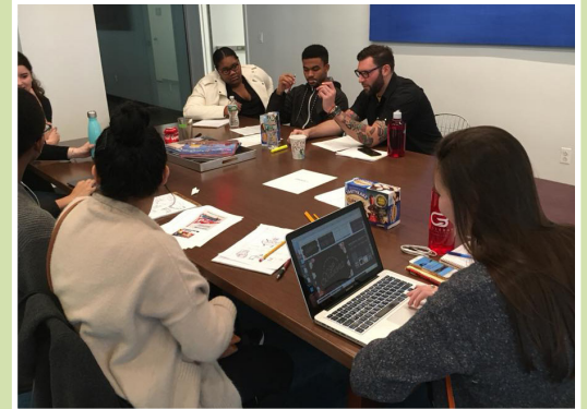
Students from our College Access Program gain firsthand knowledge about careers in marketing and advertising through a daylong event hosted by the Garfield Group.