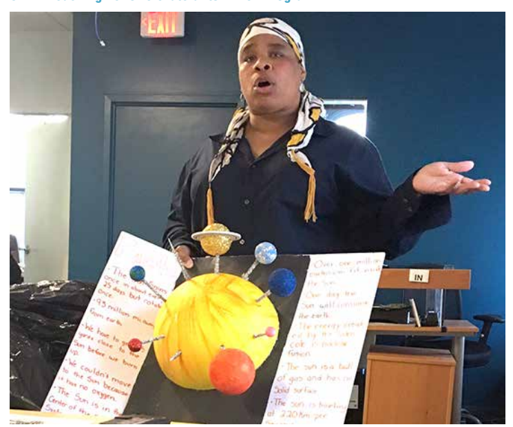
STEM Teaching Fellows Grateful to Finish Program

Pre-pandemic, the PECO-sponsored McKinney Center Teaching Fellows Program, administered by PEF, met Monday nights for hands-on workshops and to work on their capstone projects. During the pandemic, PEF staff created an online community to allow the Fellows to meet, share and critique presentations via the web. Projects ranged from "Designing Energy-Efficient Houses" to "Maker-Spaces." The teachers were grateful to be able to continue the program, and virtual attendance was better than in-person! The PECO STEM Teaching Fellows Program is being continued for 2021.