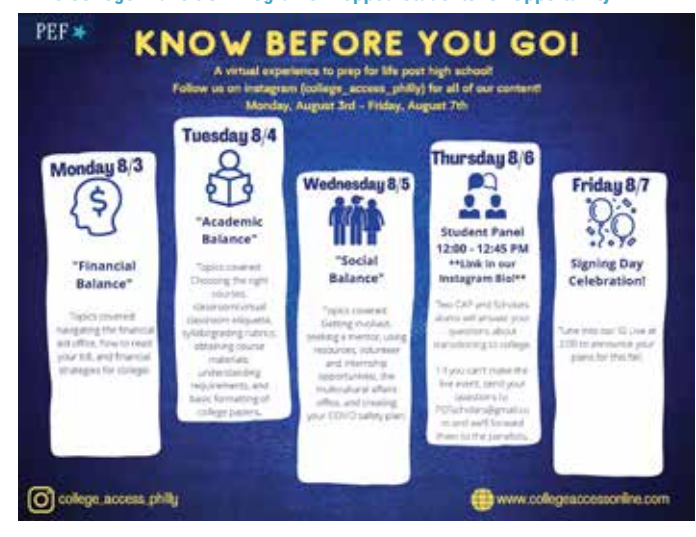
PEF's College Transition Programs Prepped Students for Opportunity

Whether starting in-person or online, moving from high school to college is an exciting time. New fields to study, people to meet, literal and virtual landscapes to navigate – it's a big transition. PEF's annual Know Before You Go and First Year Experience programs provide the "orientation before the Orientation" by helping graduates of our College Access Program and recipients of our Philadelphia Scholars Last Dollar Scholarship prepare for those initial weeks "on campus."