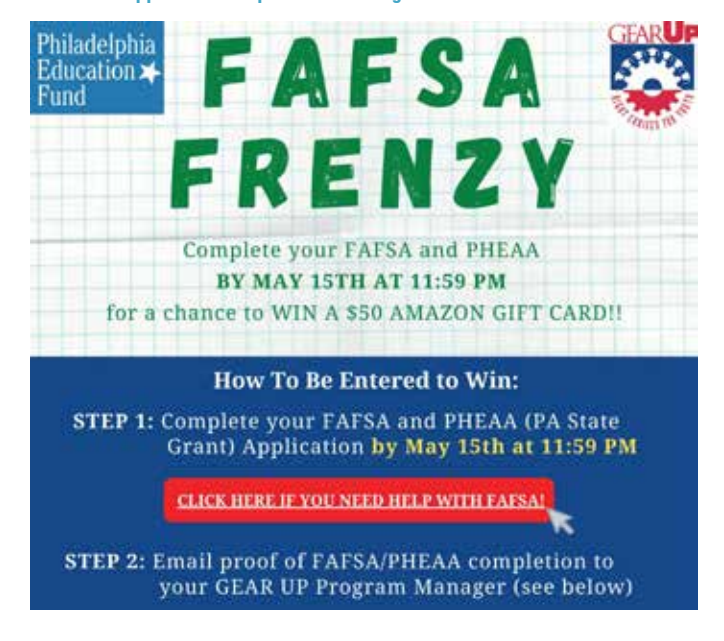
Financial Aid Application Help Turns to Instagram

The annual "FAFSA Frenzy," the campaign to get every high school senior to complete their FAFSA (Free Application for Federal Student Aid) by the May 15 deadline, was re-created on PEF's new Instagram account. Much like a tax form, the FAFSA demands time, family financial documents, and a certain familiarity with the language of government – all customarily provided in the school by PEF College Access and Gear Up counselors. The closing of schools, prospective colleges, and government agencies made the task especially daunting. The solution was to go to where their students are – on social media – and with the chance to win a $50 gift card.