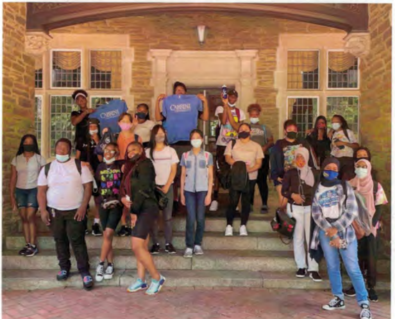
Students visit Cabrini University

PEF is grateful to the William Penn Foundation for funding support and University of the Sciences for providing classroom space, lectures, and workshops.