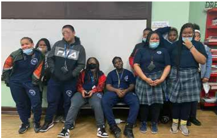
Spark students of Middle Years Alternative School.

It's hard to believe that Spark is coming to a close at the end of May! Spark Mentorships are ongoing at Lea Community School, Boys Latin Charter School, and Middle Years Alternative School. Overall, we have 64 mentors and 55 mentees participating in the program this spring. Our groups spent time getting to know each other and working on social emotional learning skills like relationship skills and responsible decision making. They are now engaged in creating their projects, which they will present to the entire group during the last week of Spark. Some of our topics this year include pitching a brand new NFL team and researching how plants affect mood. We're excited to see the final product of everyone's hard work!